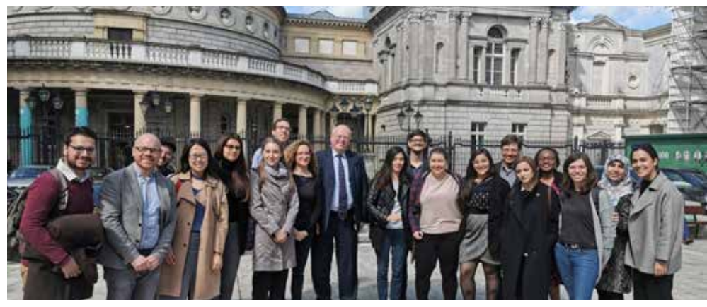
Conference delegates with Senator Michael McDowell SC at Leinster House

ATLAS was formed in 2006 with the mission of bringing together talented doctoral students in the field of transnational law (broadly defined). The annual Agora consists of a programme of dissertation workshops, allowing students to share and receive peer and expert feedback on their research, masterclasses, and a series of