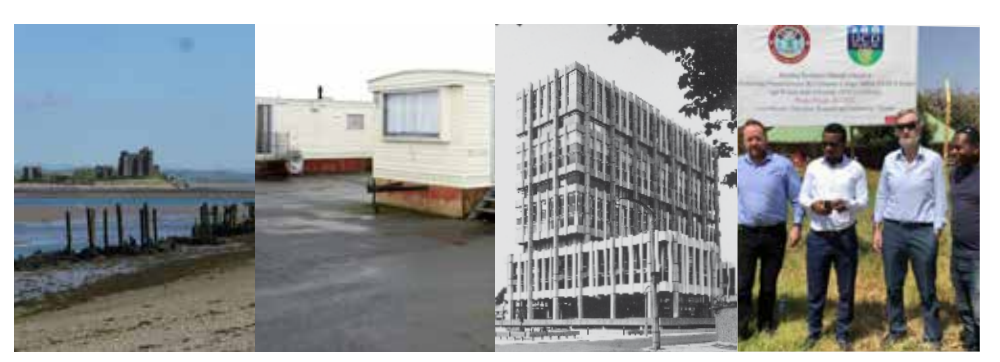
5 Delving into the cultural value of coastlines