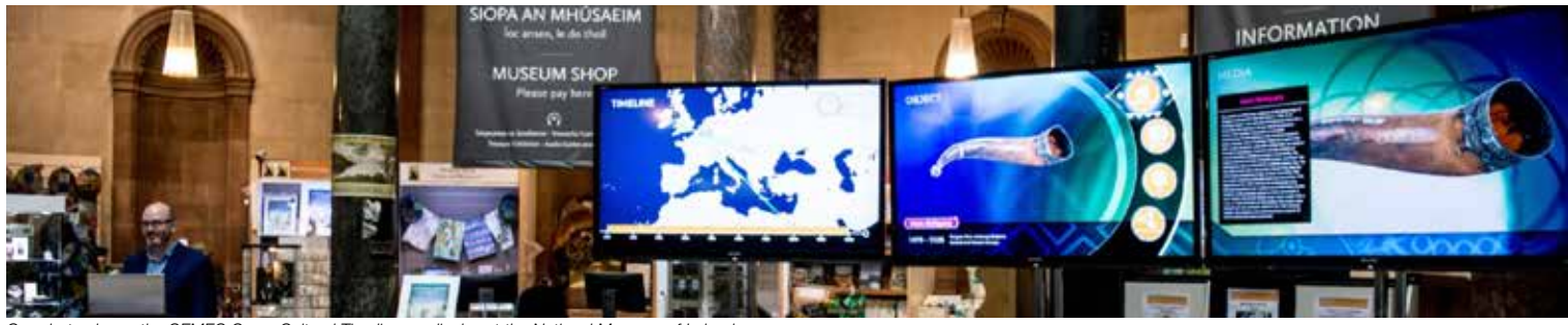
Our photo shows the CFMFC Cross Cultural Timeline on display at the National Museum of Ireland