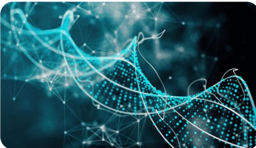
Cell & Molecular Biology