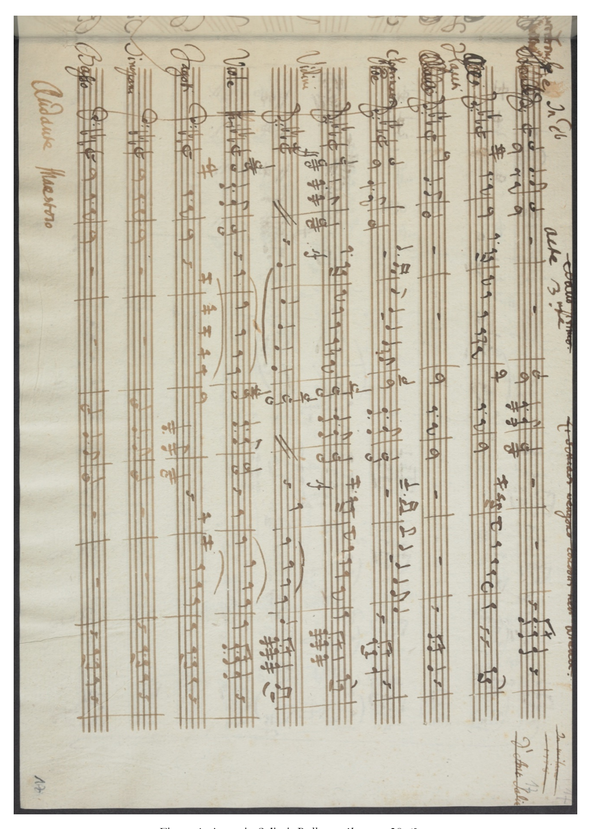
Figure 1: Antonio Salieri, Ballettmusik, page 38. 45