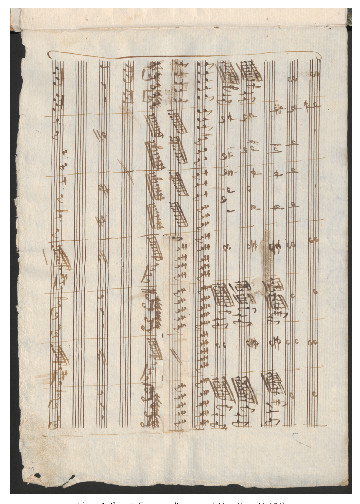
Figure 3: Cesare in Farmacusa, 'Tempeste di Mare,' bars 46-52.47