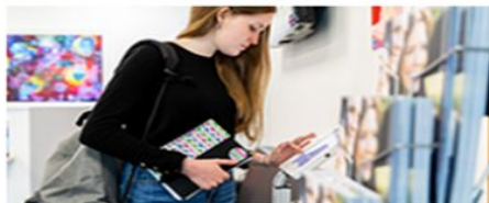
Find a job or internship