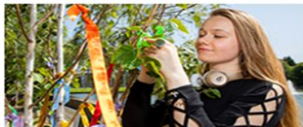
Build your Skills