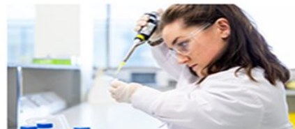
Explore your career options